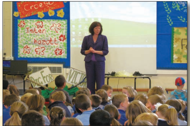
Speaking to pupils at St. Joseph's Roman Catholic Primary School, Penarth on Europe Day Yn siarad â disgyblion Ysgol Gynradd Sant Joseph, Penarth ar Ddydd Ewrop