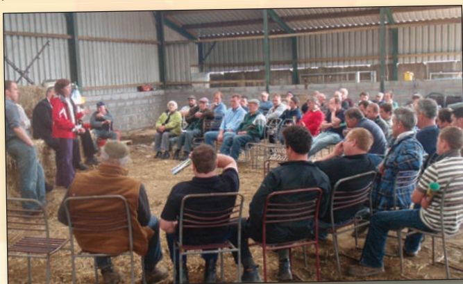
Talking to farmers on Ty'n Llwyfan farm in Llanfairfechan Yn siarad â ffermwyr ar fferm Ty'n Llwyfan yn Llanfairfechan