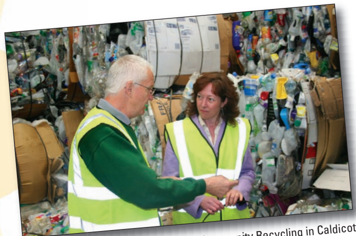
A visit to Monmouthshire Community Recycling in Caldicot Ymweliad ag Ailgylchu Cymunedol Sir Fynwy yng Nghil y Coed