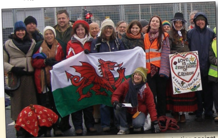
At the Aldermaston Atomic Weapons Establishment protesting against Trident nuclear weapons Yn Sefydliad Arfau Atomig Aldermaston yn protestio yn erbyn arfau niwclear Trident