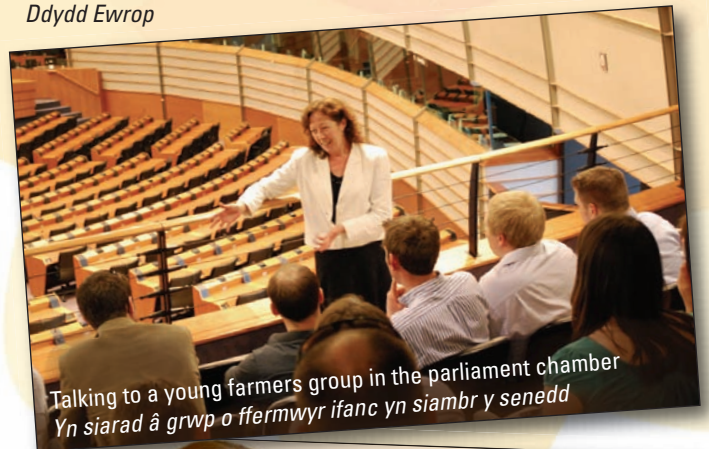
Talking to a young farmers group in the parliament chamber Yn siarad â grwp o ffermwyr ifanc yn siambr y senedd