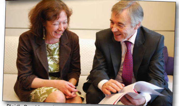
Plaid's President-elect with party leader and Deputy First Minister Ieuan Wyn Jones AM Llywydd newydd Plaid gydag arweinydd y blaid a Dirprwy Prif Weinidog Ieuan Wyn Jones AC