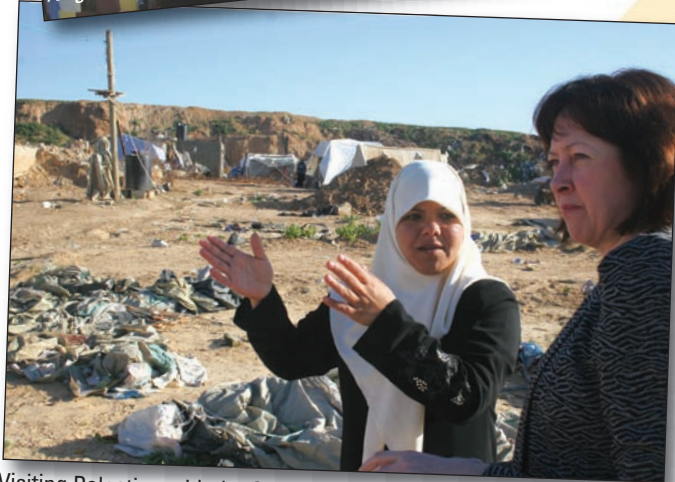
Visiting Palestine with the Campaign to End the Siege of Gaza Yn ymweld â Phalesteina gyda'r Ymgyrch i ddod â'r gwarchae ar Gaza i ben